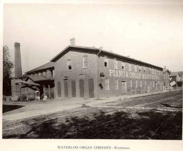
WATERLOO ORGAN COMPANY—WATERLOO.